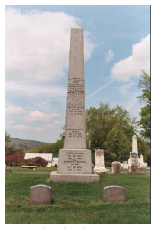
East face of obelisk - Photo #3