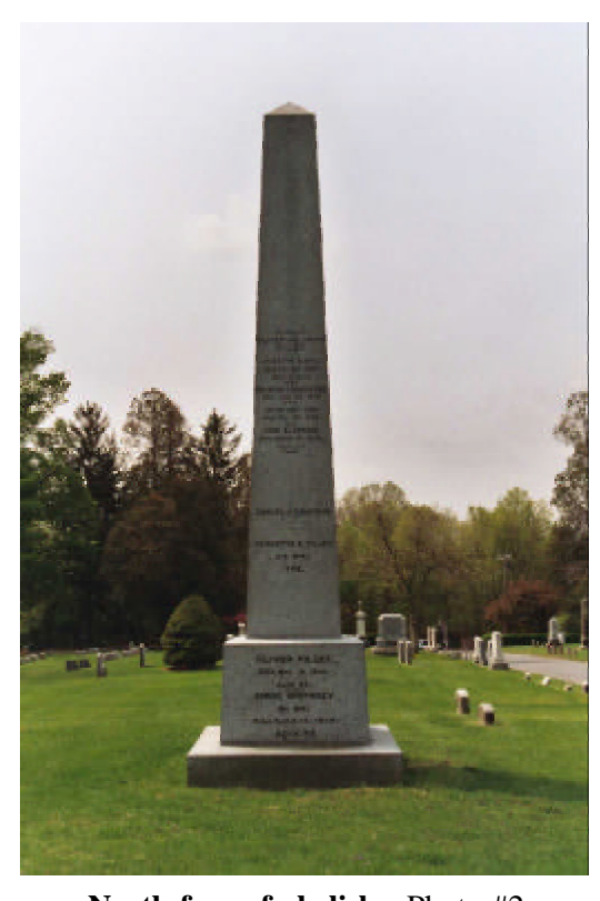
North face of obelisk - Photo #2