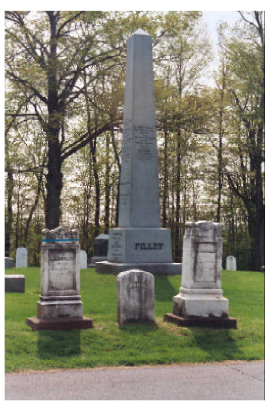
West face of obelisk - Photo #1

Mountain View Cemetery 30 Mountain Avenue, Bloomfield, CT 8 March 2000, updated to May 2004