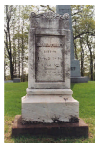
Oliver Filley - Photo #5

Mountain View Cemetery 30 Mountain Avenue, Bloomfield, CT 8 March 2000, updated to May 2004