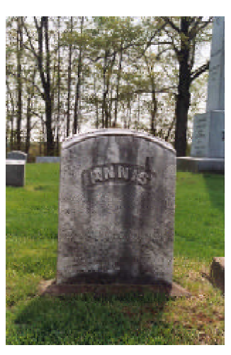
Annis - Photo #6