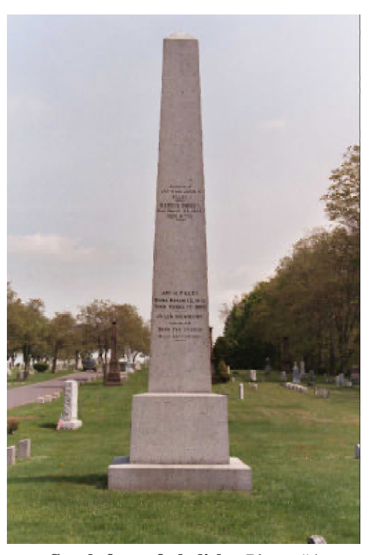
South face of obelisk - Photo #4